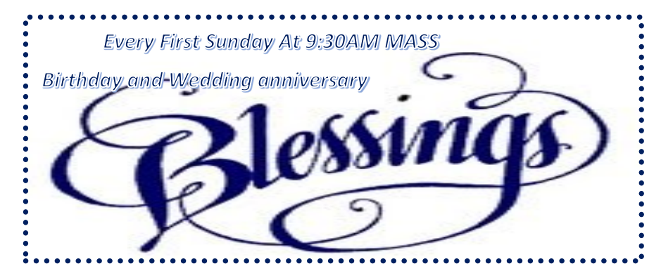
Set Reminder for these upcoming Events...