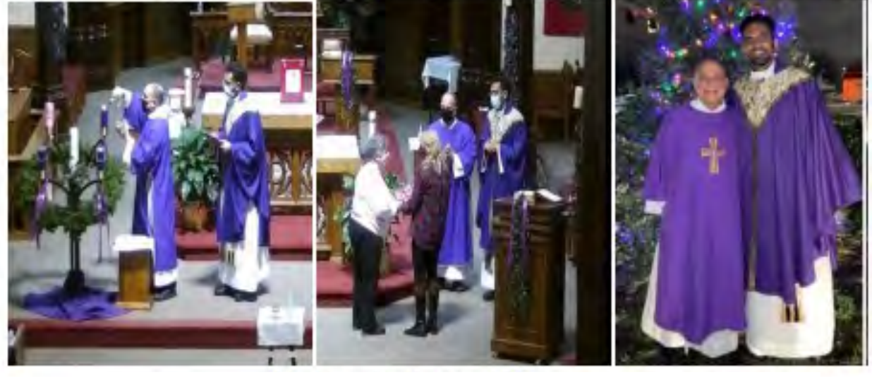
CHRISTMAS TREE_LIGHTING 2020