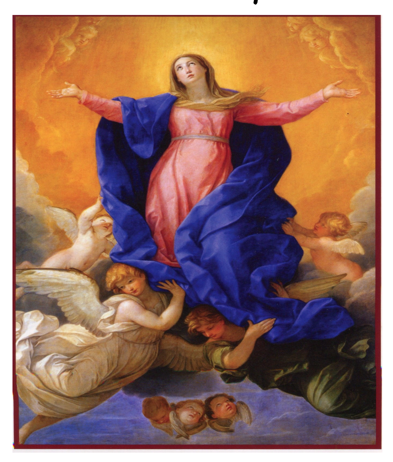
Of the Blessed Virgin Mary